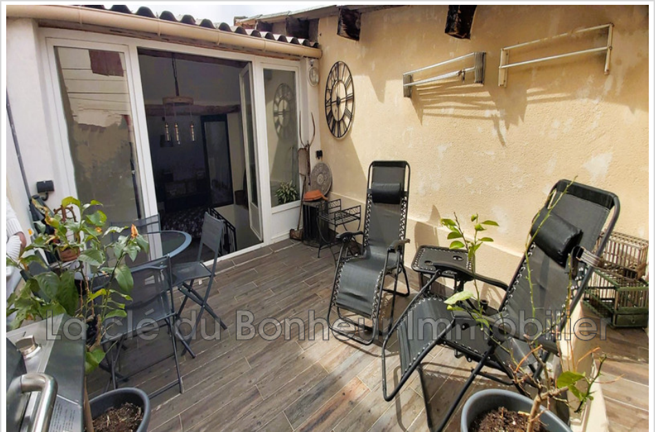
Townhouse Riez ref. 871V682M - mandat n°1225SS